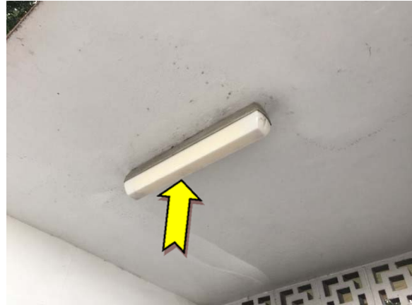
Photo 2. Interior, ground level, single tubed fluorescent light fitting – suspected PCB-containing capacitors.