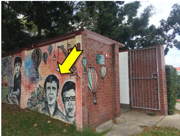
Photo 3. Exterior, throughout, graffiti wall – suspected lead-containing various upper coloured paint systems.