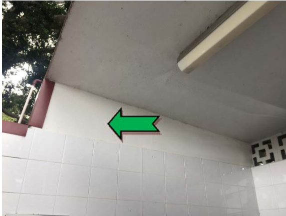
Photo 1. Interior, top of partition walls – non asbestos-containing fibre cement sheeting.